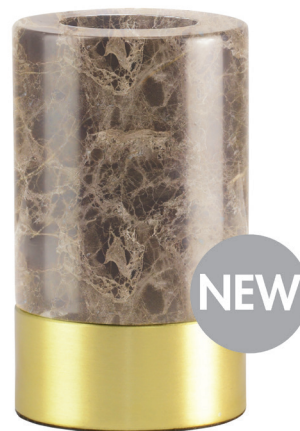
Câble | Cable